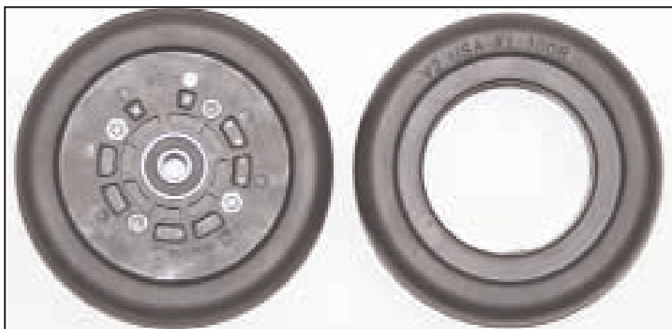
Complete XL100R wheel and replacement tire.